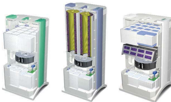
IQAir systems are optimised by various filter technologies to meet the special requirements of air hygiene in different medical sectors

The IQAir Series consists of several modular filter systems, each optimised to deal with a different range of airborne contaminants or aiming to fulfil a specific air hygiene requirement. The IQAir Chemisorber for instance has the primary function to filter aldehydes, while the IQAir Cleanroom H13 is dedicated to the removal of airborne microorganisms (e.g. bacteria, viruses & spores).