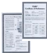
IQAir Quality Control: The actual efficiency test results are documented on the numbered test certificate supplied with each IQAir system.