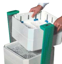
Safe and easy filter change within seconds

In spite of the array of advanced features, the cost of IQAir systems is only a fraction of that of centralised air cleaning systems. As a result, IQAir systems enable health-care facilities to add to, or extend airborne hygiene measures to areas and patients which so far were not within the scope of an advanced airborne infection control strategy.