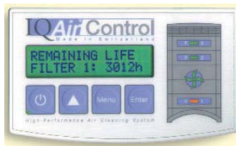
LED on the control panel turns red when it's time to change a filter

With regard to maintenance and filter change, the IQAir Series offers several advanced features. Every model is equipped with its very own microchip-controlled filter life monitor, taking air pollution load, actual usage and fan speed into account. When a filter element reaches the end of its useful life, an LED indicator will light up on the IQAir's control panel, informing staff that it is time to change filters.