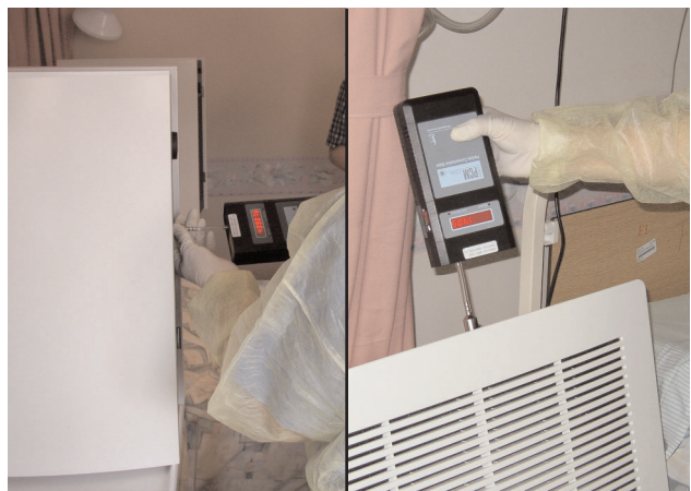
A Senior Engineer of the EMSD assesses the actual filtration efficiency of two air cleaners with a laser particle counter. The majority of conventional air cleaners failed the efficiency test.

In order to find the most efficient, reliable, flexible and cost effective solution, the Electrical and Mechanical Services Department (EMSD) of the Hong Kong Government performed rigorous tests on behalf of the HKHA. They evaluated the suitability and performance of many filtration systems, including IQAir®. With the help of a laser particle counter the EMSD tested the actual filtration efficiency of each filtration system.