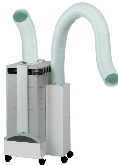
The customised IQAir® filtration solution for the Hong Kong Hospital Authority combines an IQAir® filtration system with the FlexVac™ source capture kit and special flexible OutFlow™.

filtration process. At the final filtration stage IQAir®'s independently type-tested HyperHEPA® filter removes even the tiniest of airborne microorganisms, including the SARS virus, with an efficiency in excess of 99.5%. As a result the risk of infection within the patient's room can be greatly reduced, thus providing a safer working environment for health-care personnel and limiting the risk of spreading the disease.