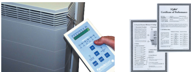
Each IQAir® HEPA filter system is individually tested for filtration efficiency and air delivery. The actual test results are documented on a numbered test certificate.

The efficiency tests quickly revealed that most of the air cleaners failed to remove airborne particulates with the required actual efficiency in excess of 99.97% for particles of 0.3 µm and larger. With its certified and independently type-tested filtration efficiency IQAir® passed this test. After the preliminary selection process, it was the EMSD's aim to select an infection control system that could be put into action in a matter of minutes and that would be able to effectively limit the threat of airborne disease transmission from a SARS patient to health-care workers by providing reliable and certified actual filtration performance.