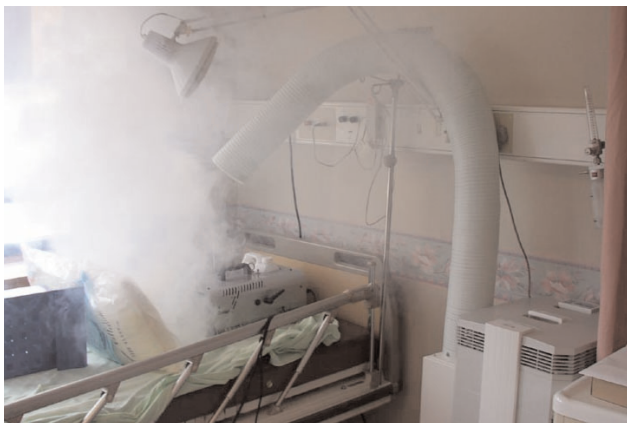
Testing the IQAir® in location. Artificial smoke is generated on a hospital bed and then captured at source with the help of the IQAir® FlexVac™'s flexible suction arm.

Thanks to the professional effort of a Hong Kong based authorised IQAir® dealership and IQAir®'s previous experience in the field of hospital infection control (see IQAir® press release "Decentralised Airborne Infection Control in Health-Care Facilities"), IQAir® was able to develop a tailor-made SARS control solution for the hospitals managed by the HKHA.