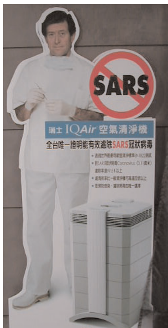
Taiwanese IQAir® display.

It is clear that vigilance for SARS must be maintained, because resurgence of the virus is possible. As a world leading manufacturer of mobile air cleaning systems IQAir® feel honoured and privileged to be able to play an important part in providing professional air cleaning solutions for the fight against SARS and other airborne infection control challenges.